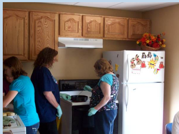
Cooking breakfast together.

we travel like to go mall walking and to the library. We continue to thank our staff, for a wonderful job. "Thanks Staff!"