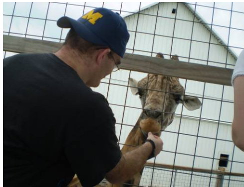
He is feeding Sam the giraffe.