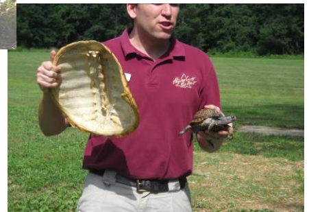
He is talking about turtles.